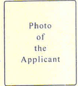
Photo of the Applicant